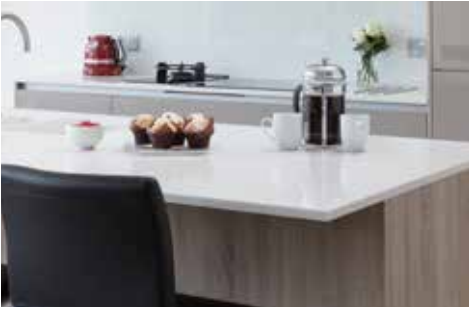
Save £350 on Corian*