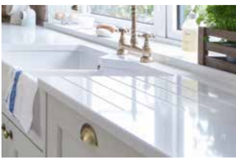
FREE Drainer Grooves* Worth £168