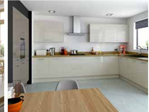
20% off The Masterclass Collection*

15% off The H Line Collection<sup>*</sup>